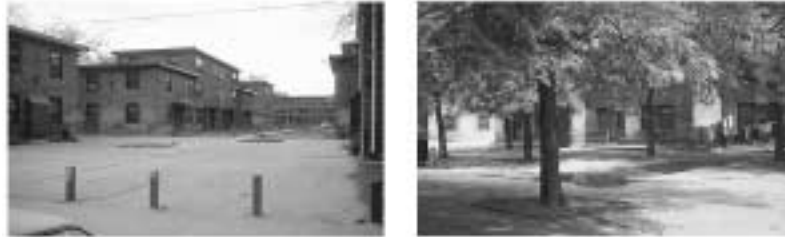
Figure 1: Ground Level View at Ida B. Wells Showing Apartment Buildings With Varying Amounts of Tree and Grass Cover

leaving some areas completely barren, others with small trees or some grass, and still others with mature high-canopy trees (see Figure 1). Because shrubs were relatively rare, vegetation at Ida B. Wells was essentially the amount of tree and grass cover around each building.